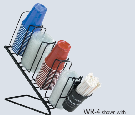
WR-4 shown with WR-STAND & WR-STRAW