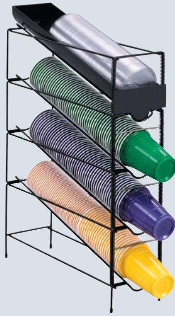
WR-CT-4 shown with WR-CT-LID