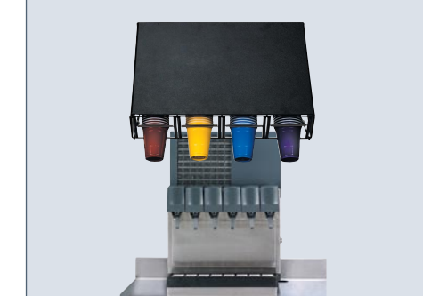
WR-CT-OVRHD shown with WR-CT-COVER